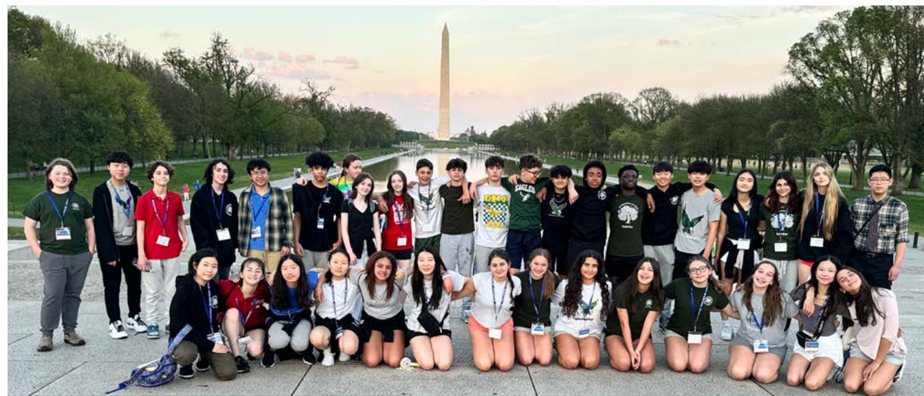
Washington D.C. Eighth Grade Class Trip