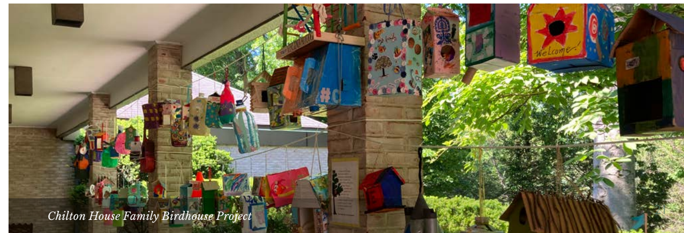
Chilton House Family Birdhouse Project